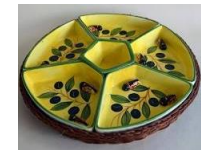
Della Robbia Pottery