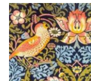
William Morris wallpaper design