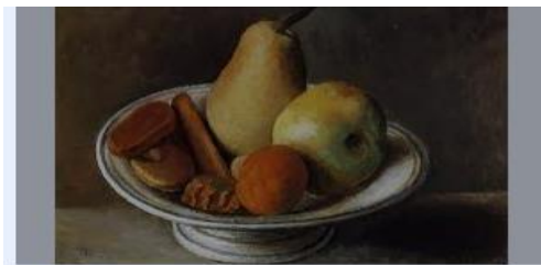
Pablo Picasso - Bowl of Fruit