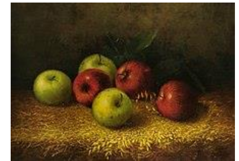
Charles Ethan Porter – Apples on the ground