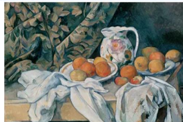
Paul Cezanne – Still Life with a Curtain