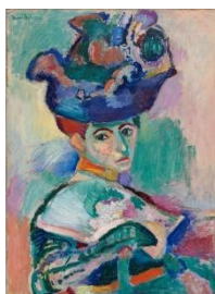
Woman with a Hat (1905)