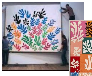
Leaf Cutouts (1953)