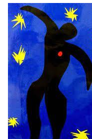
The Fall of Icarus (1947)

During the last decade of his life Henri Matisse deployed two simple materials—white paper and gouache—to create works of wide-ranging colour and complexity using cut outs. An unorthodox implement, a pair of scissors, was the tool Matisse used to transform paint and paper into a world of plants, animals, figures, and shapes.