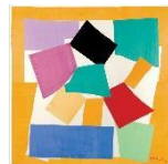
The Snail (1953)