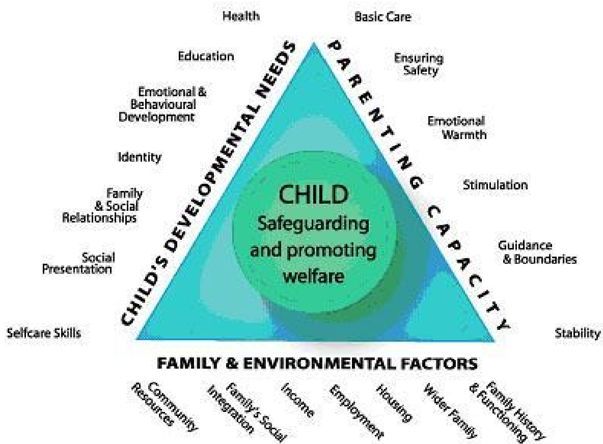
Figure 1 – The Assessment Framework 42